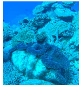
Tridacna Gigas—The True Giant Clam

This status would protect our Giant Clams as well as the aquatic life that live on the reef.