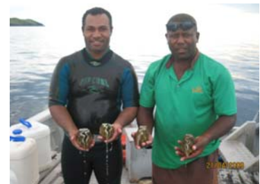
Preparing to plant Tridacna Gigas Clams

"Tridacna Gigas—is the largest species of Giant Clam in the World growing to an impressive 1.5 metres and weighing up to 150kg!."