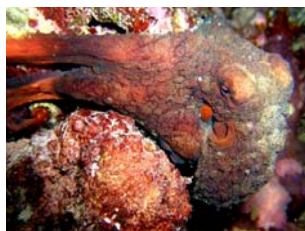
Octopus - a natural predator of Giant Clams