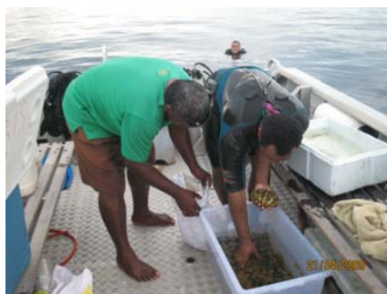
Baby Tridacna Gigas arrive at Tokoriki

The Giant Clams planted by 'The Tokoriki Island Giant Clam Regeneration Project' have all come, and continue to come from the Ministry of Fisheries Research Station on Makogai Island in Eastern Fiji.